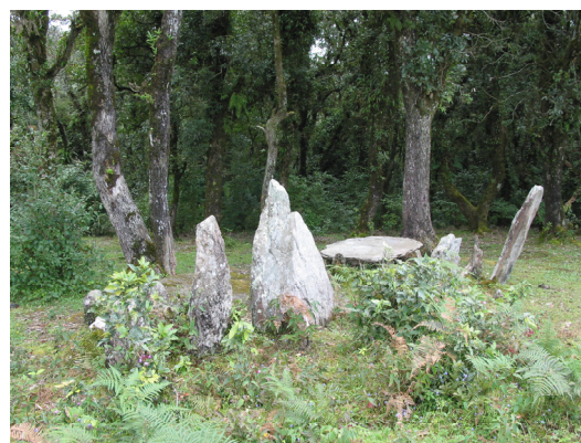
Sacred groves in Meghalaya (Northeast India): Traditional method of conserving plant diversity

The Apatani eco-cultural landscape in the Apatani or Ziro Valley of Arunachal Pradesh in Northeast India signifies another excellent example of a distinct community-based natural resource management practice in the Eastern Himalayas. This highly evolved cultural landscape consists of a complex and yet productive agroecosystem with a productive set of community managed forests (Kumar & Ramakrishnan, 1990). While shifting cultivation is the major land-use practice in the hilly regions of Northeast India, the lesser known Apatani tribe inhabiting the Ziro or Apatani valley in Arunachal Pradesh have been known to practice sedentary wet-rice cultivation integrated with pisciculture and rural forestry in the restricted flat valley land. This age-old practice has not only maintained sustainable productivity levels but has also been very energy efficient (Rai, 2005). The rich traditional ecological knowledge system practiced by the Apatani tribe for the maintenance of their sustainable livelihoods exemplifies their position as efficient resource managers,