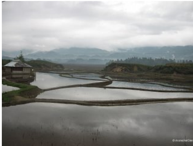
Wet-rice fields in the Apatani valley just before planting of rice saplings